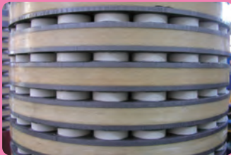
Iron Core Divided by Air Gaps

And also, they are necessary to prevent the self-exciting phenomena of generator and the over-voltage phenomena at each receiving end under light-load condition because of the presence of static capacitance in the power transmission line.